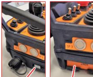
Gross Funk V21