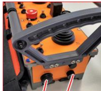
Gross Funk K2/K2+